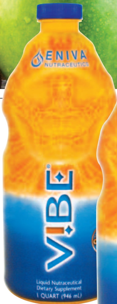
VIBE® Cardiac and Life Cellular Defense Formula