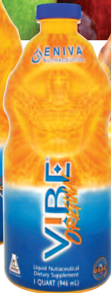
VIBE® Original Energy and Life Cellular Defense Formula