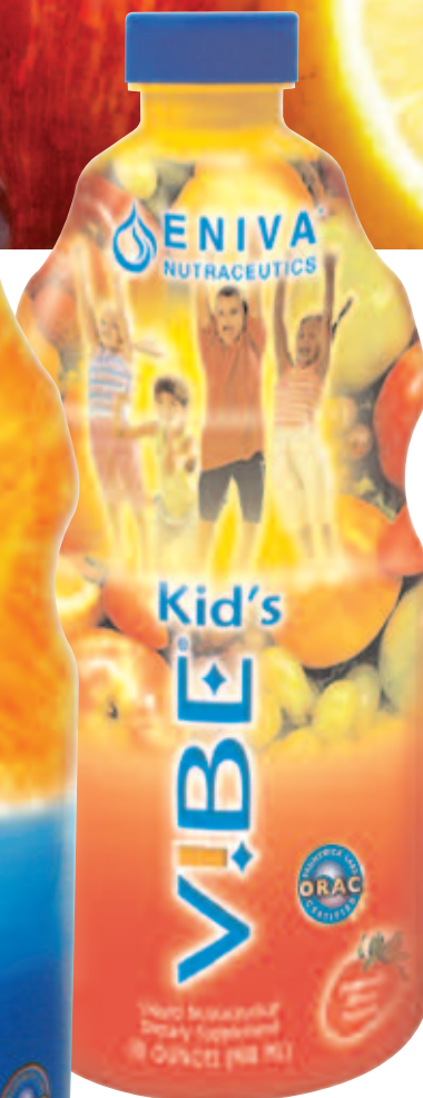
VIBE® Kid's Children's Support Formula